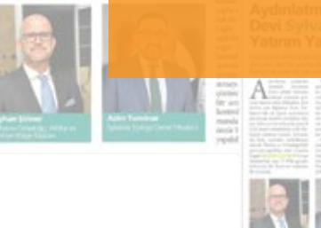
Aydınlatmada Dünya Devi Sylvania Türkiye'ye Yatırım Yapıyor

484 Media coverage in 35 Magazine, 61 News, 423 Portals, 14 Newspapers and sectoral publications. Reached 2.928.710 people.