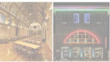
Aydınlatmada Dünya Devi Sylvania Türkiye'ye Yatırım Yapıyor

38% of the visitors stated that they can make a purchase and 14% of the visitors can authorise a purchase.