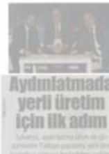
Aydınlatmada yerli üretim için ilk adım

Genel Yürütücüsü, "Bu fuar, sektörün geleceği için önemli bir platformdur. Sektörün en güncel gelişmelerini ve yeniliklerini burada tartışabiliriz."