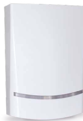
SRL800 SRL900 wireless outdoor siren