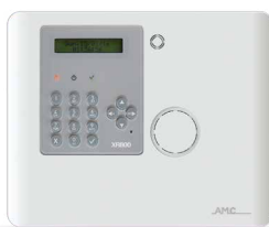
XR800 XR900 wireless control panel

It is usable with all 800/900 Series wireless system