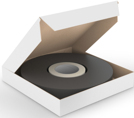
QuelCoil Continuous Intuwrap

QuelCoil Continuous Intuwrap is used to maintain the fire rating of walls where they have been penetrated by plastic pipes and/or metallic pipes with combustible insulation.