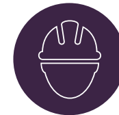
Health & Safety