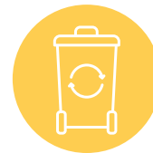
Material Use & Waste Management