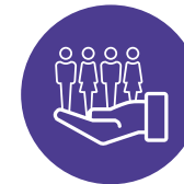
Community & Charitable Giving